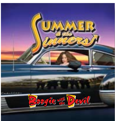
SUMMER & THE SINNERS AUGUST 14