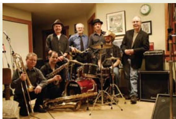
GROOVE KITCHEN JULY 31