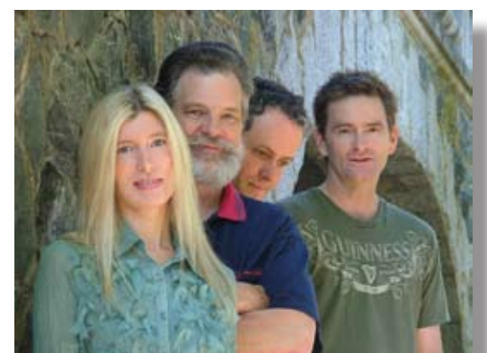
COOKEILIDH AUGUST 28