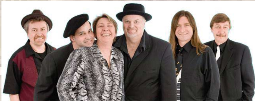
July 3 SOUL SHAKERS